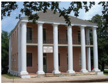
WEST FELICIANA RR BUILDING . 1834 THE WILKINSON COUNTY MUSEUM 1991