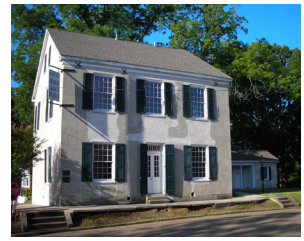
THE BANK OF MISSISSIPPI . 1819 THE AFRICAN AMERICAN MUSEUM 2004